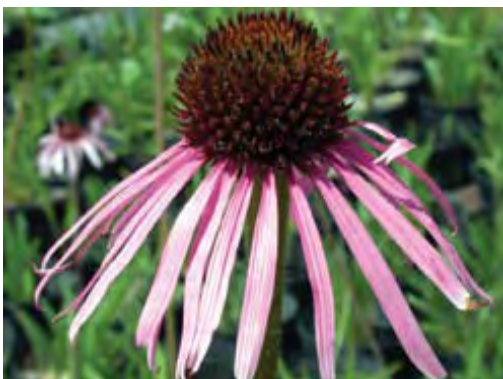
Pale Purple Coneflower