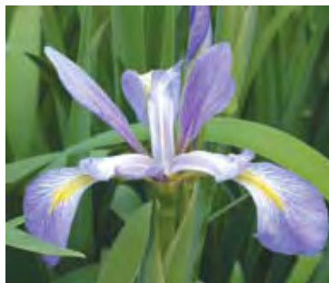
Blue Flag Iris