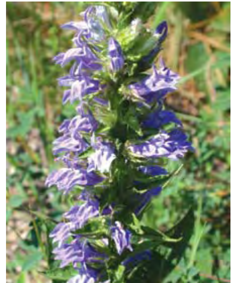
Great Blue Lobelia