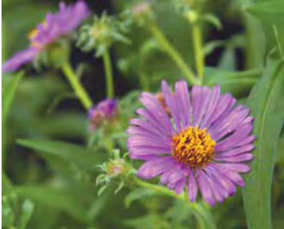
New England Aster