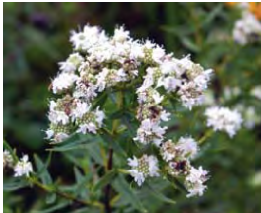
Virginia Mountain Mint