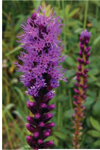
Marsh Blazing Star