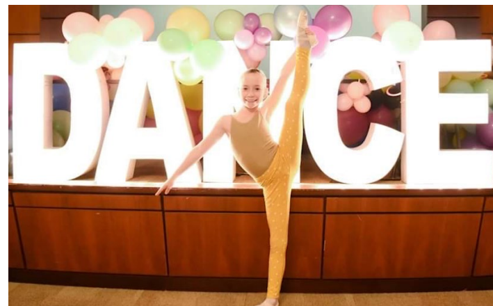
The En Pointe Indiana Ballet hosted a public mixed rep showcase.

Projects can be exhibits, events, programs, displays, or other artistic or cultural expressions and should relate to two or more of the Commission's core values: Inclusive, Authentic, Engaging, Collaborative, Innovative, and Educational.