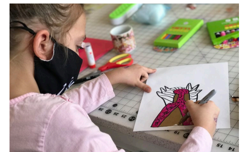
A student makes art with Sewful Cheryl.