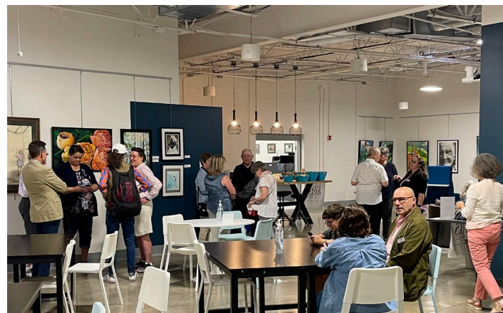
Fishers Arts Council hosts monthly art receptions at The Hub at HCCF.