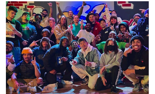
31Svn Dance Academy's break dancing battle.