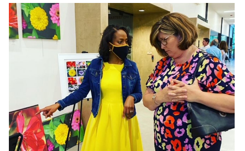
A reception hosted by High Frequency Arts.