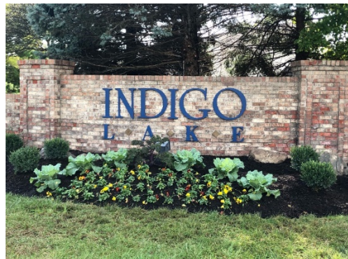
Entrance landscaping at Indigo Lake