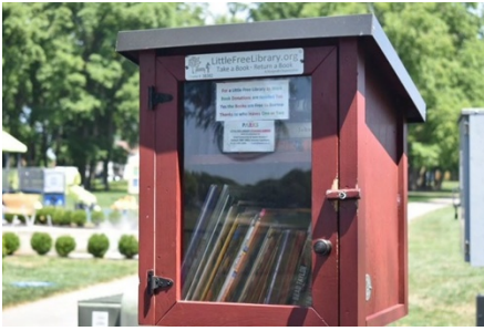
Little free library serving Sunblest Neighborhood