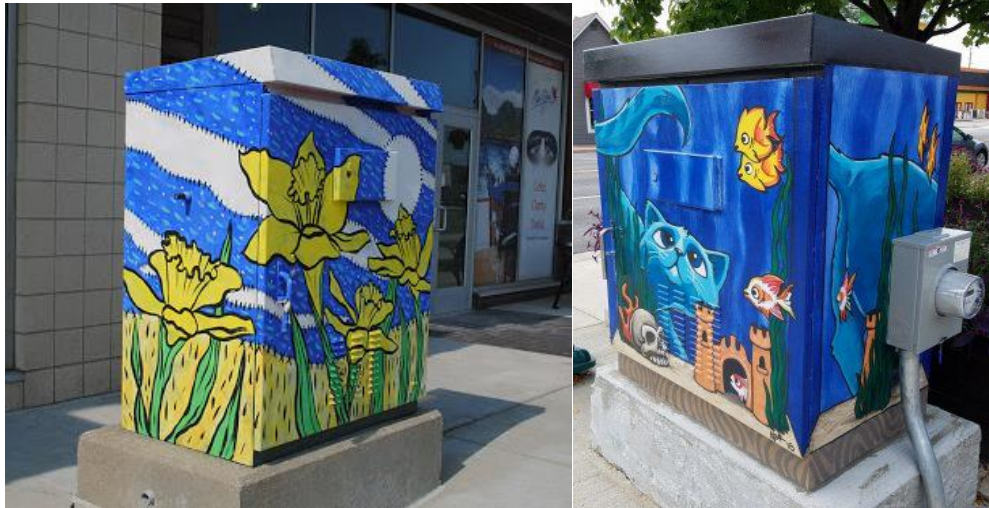
Potential Locations along 116th Street

way to activate existing non-traditional canvases that add to the vibrancy of the downtown. This proposal would add four (4) to six (6) more painted electrical boxes along high-volume corridors like 116 th Street. This project can be implemented right of way and would go through the Nickel Plate District Cultural Designation Subcommittee for approval.