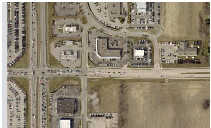
Aerial view of existing intersection