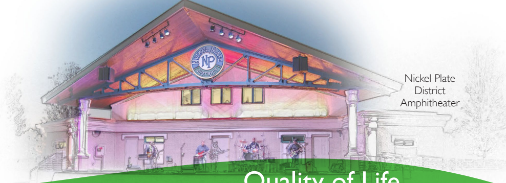
Nickel Plate District Amphitheater