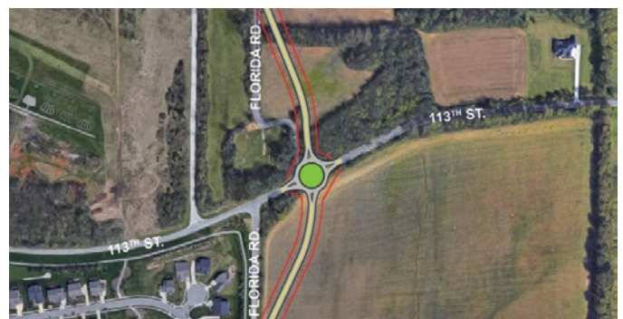
A RENDERING OF THE INTERSECTION